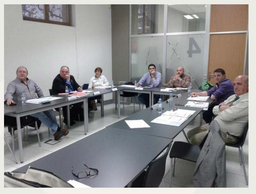
Company trainer programme in Zaragoza